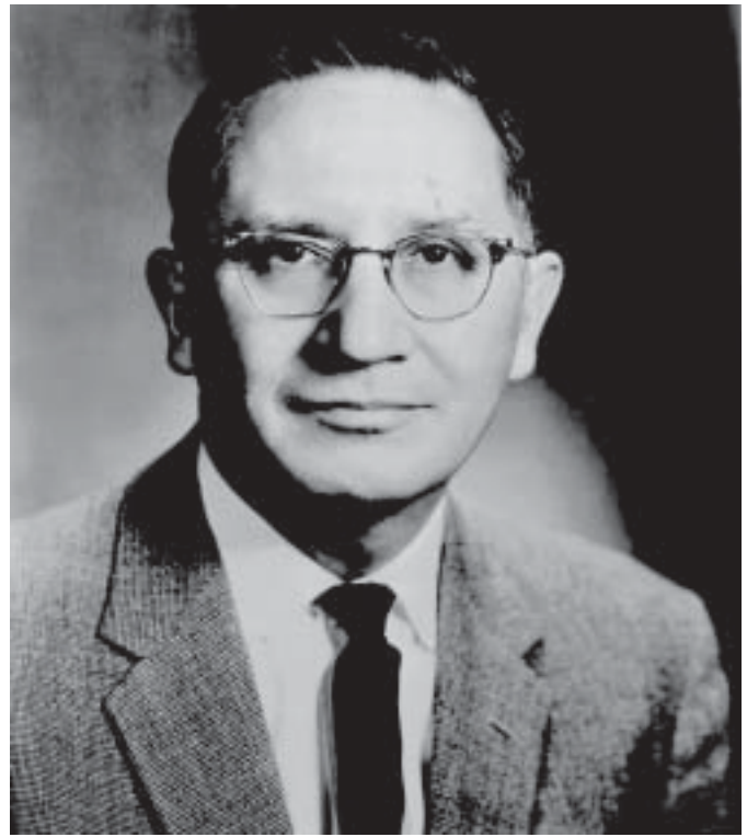
Representative Ben Reifel of South Dakota