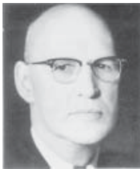
Oliver Wendell Holmes