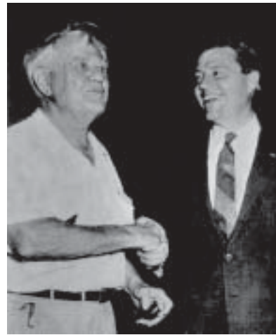
Senator Ralph W. Yarborough

Legislator! With its battery of Senators and Representatives from Western States, the United States Congress posed a reservoir of Washington Westerner talent. A look back reveals that legislators have actively participated in Corral activities as members, speakers, authors, officials.