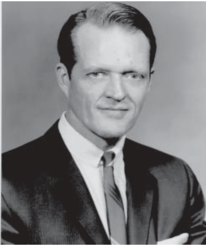
Representative David S. King of Utah